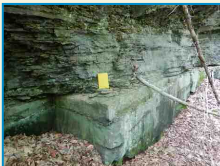
Shaley top rock removal in process.