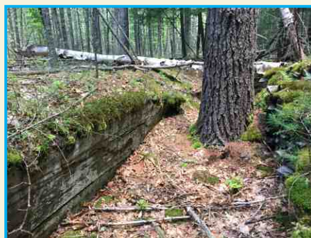
Overgrown trench quarry.