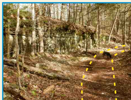
Cliff quarry and old wagon road.