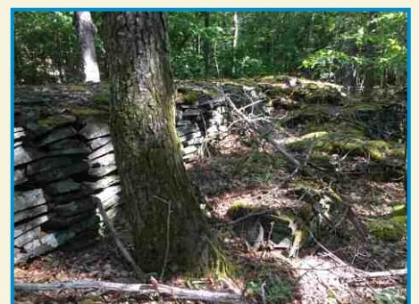
Stone berm alongside trench quarry.