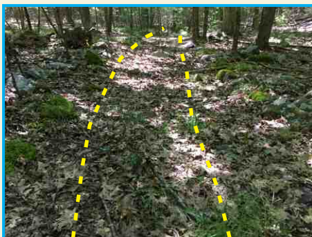
Relict wagon road.

Depuy Quarry: The 162-year-old French survey map depicts an area labeled Depuy Quarry situated between Waughkonk and Moray Hill roads. While French's focus was on accurately surveying roads, he took some artistic license in placing other features such as lakes and quarries. Figure A shows that the Depuy Quarry area encompassed Oak Quarry, as well as numerous smaller cliff and trench quarries – some extending into the 850 Route 28 property (see 12-07-20 HydroQuest report for additional information). A steep scarp near the eastern face of Oak Quarry dictated flagstone transport on wagon roads to both Waughkonk and Moray Hill roads. Example features in this area are illustrated below. Historic research is ongoing.