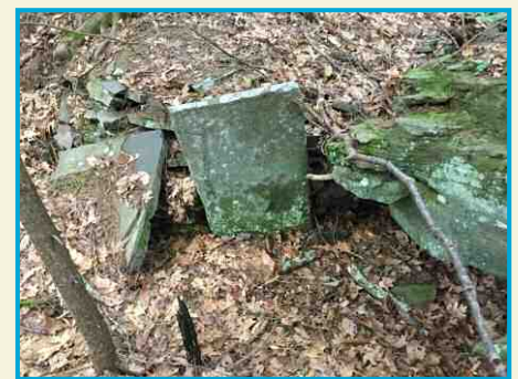
Small abandoned flagstones.